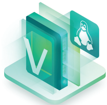
Veeam Agent for Linux